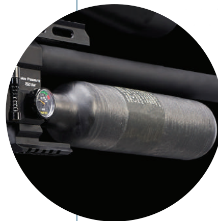
Optional Carbon Tube